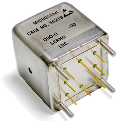
Figure 1 – 9600/9700 Family of Oscillators

radiation hardened above 100 krad (Si), along with neutron insensitivity, SEL immunity and SEU acceptable behavior. As is the case with Microsemi's space qualified crystal oscillators, an adapted Colpitts configuration is employed for oscillation and the crystal of choice is a 3 rd overtone SC ( Stress Compensated Device.) The oscillator represents a good trade-off of high performance and SWaP ( Size Weight and Power).