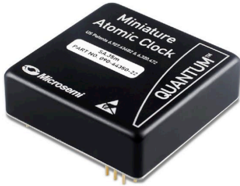
Figure 4 - SA33 Rubidium Oscillator