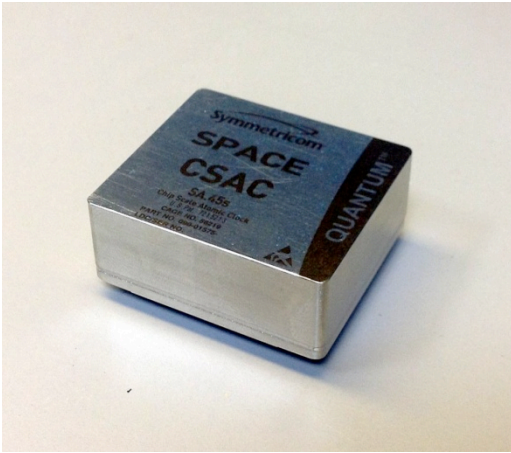
Figure 3 – Space CSAC

period and realized that performance in environments of up to 50 krad (Si) was reasonable by replacement of a radiation susceptible TCXO with a radiation tolerant device and increasing the shielding thickness . The paper presented on the Space CSAC is referenced at the end of this paper and provides a comprehensive summary of the oscillator.